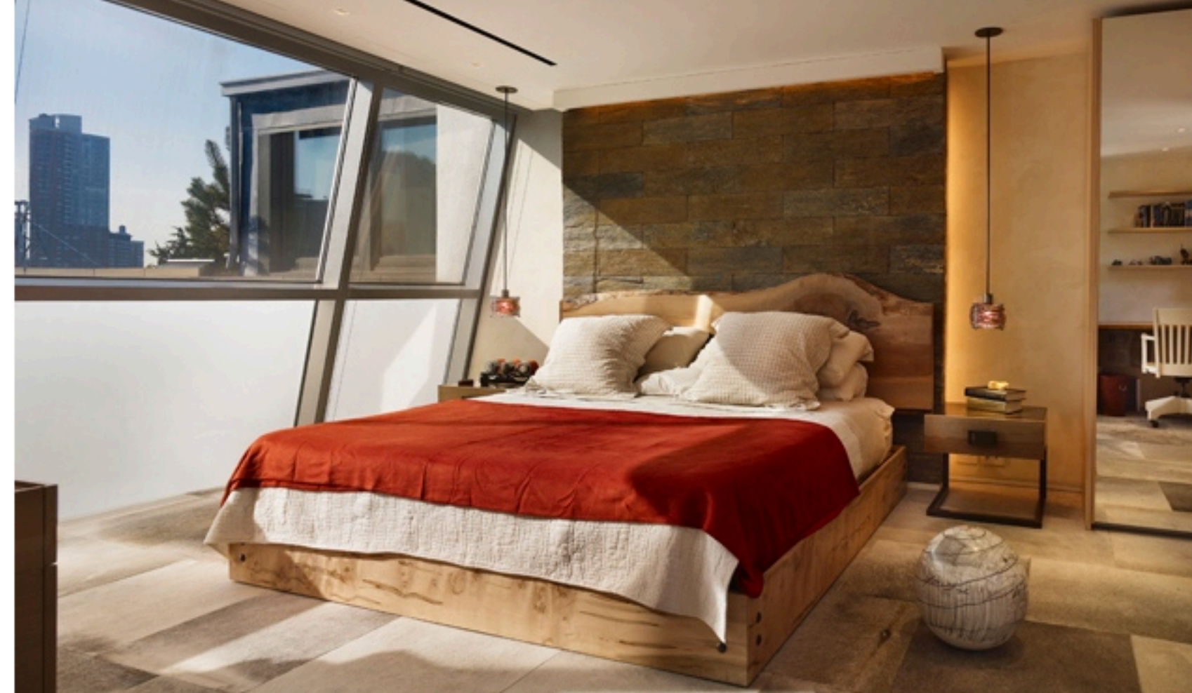
PUBLISHED: 09/30/2011 1:16:30